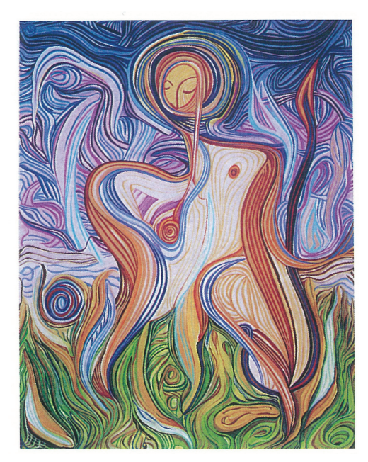
Figure 3. Chamber 13 Painting . "Nurturance of Life". Reprod. from Collector's Edition print, with permission.

SE effectively giving it, as in the glyph, an extra eye or limb with which to work. Do they break the HI dependency on the physical survival level of consciousness? The next glyph may represent an almost circular (whole) being made up of two parts, possibly the SE and SvIg. The head/eye may indicate insight through this unity, the untity shown by the one bar.