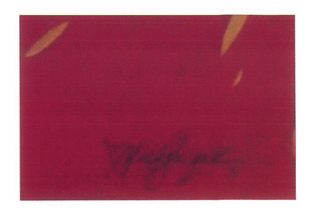
Figure 2. Signature on Chamber 20 Painting

Originally De Rosnay tentatively presented the material saying the paintings were from a group of